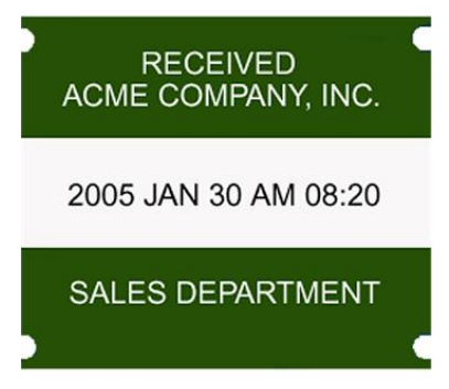
Optional Lower Die Plate